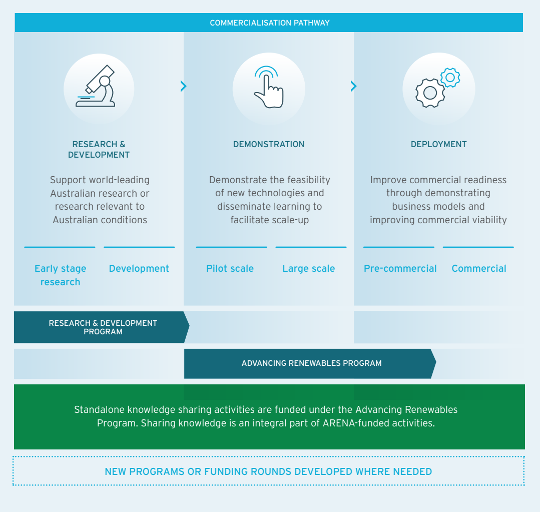
Figure 2 - Supporting innovation and commercialisation